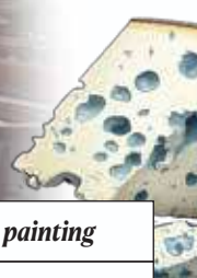
1932 - Grand re-opening of refurbished Grand Café, Surrealism style painting

Surrealism, an influential art movement of the 20th century, delved into the realm of the subconscious, creating dreamlike and illogical scenes. Artists such as Salvador Dalí and René Magritte employed unexpected juxtapositions and fantastical imagery to challenge conventional reality and tap into the mysteries of the mind.