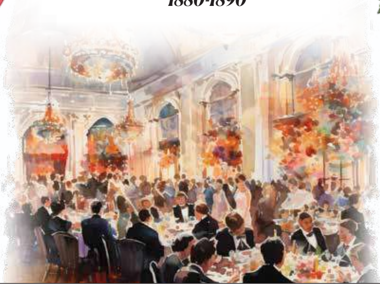
1886 - First Banquet at Mirror Hall, Impressionism style painting

Impressionism, a pivotal art movement of the late 19th century, prioritized capturing the fleeting effects of light and color in outdoor scenes. Artists of this era used loose brushwork and vivid pigments to create images that conveyed the momentary and atmospheric qualities of their subjects.