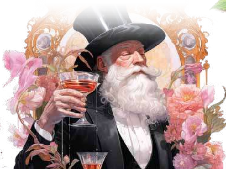
1891 - Henrik Ibsen visiting Grand Café, Art Nouveau style painting

Art Nouveau, an artistic movement flourishing in the late 19th and early 20th centuries, embraced intricate and organic designs inspired by nature. Characterized by flowing lines, ornate patterns, and a focus on craftsmanship, Art Nouveau sought to create a harmonious blend of art and everyday life.