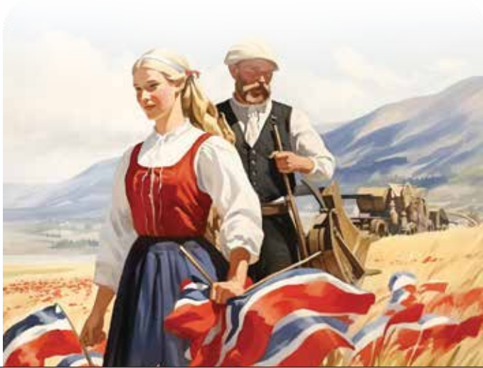
1874 - Fields surrounding Christiania (Oslo), Realism style painting

Realism, an influential art movement of the 19th century, focused on portraying subjects with an emphasis on accuracy and detail. Artists aimed to depict everyday life and society in a truthful manner, often challenging romanticized or idealized depictions. Grand Hotel Oslo opened its doors to the first guests on 15th August 1874.