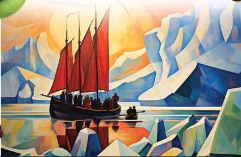
1912 - Roald Amundsen, Expedition to South Pole, Cubism style painting

Cubism, a ground breaking movement of the early 20th century, revolutionized art by deconstructing subjects into geometric shapes and viewpoints. Artists during this era, such as Picasso and Braque, explored fragmented perspectives, challenging conventional notions of representation, and presenting multiple dimensions simultaneously.